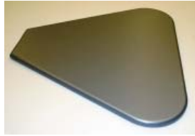
22" x 24" Counter Unit