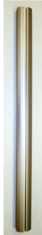
42" Main Pole Section