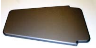
19" x 15" Counter Unit