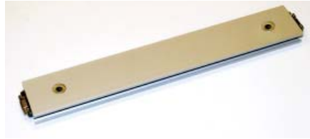
10.5" Support Bar