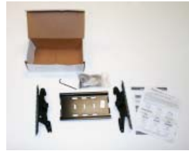
Monitor Mounting Kit